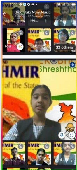
Photo Gallery of EBSB Activities